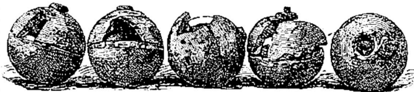
3. Bombs used in evidence, after analysis by chemists.

Many people associate Leninism, or even Marxism generally, with the type of totalitarian cult of personalities surrounding the leaders of nearly every “successful” socialist regime. Leninists typically respond that sure, cults of personality exemplify an obvious cultural shortcoming in the nation-states in question, but the leaders themselves usually did their best to actively combat obsession. According to the Leninists, critiques that reference the pattern of cults of personality lack a historical materialist understanding of the conditions surrounding the culture. Thus, the beloved leader’s hands are washed off the cult surrounding them. Although some such critiques are obvious results of American propaganda, there is still a clear issue of obsession over leadership within the Leninist tradition — and not every critique can or should be reduced to its “McCarthyist” or “rightist” origins.